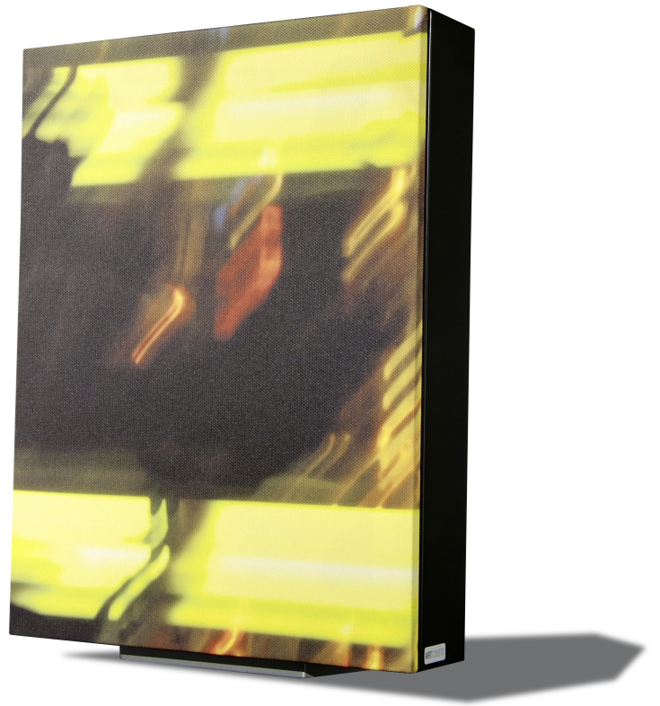
Diablo Monitor SL with optional bookshelf stand